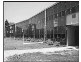
Ellen Hopkins Elementary School