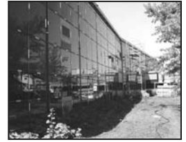
Robert Asp Elementary School