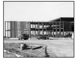
S.G. Reinertsen Elementary School

"The beauty of the district's master facility plan for elementary schools is equity. Beginning in the fall of 2004, no matter where a child lives in Moorhead, he or she will have access to the same size school with the same educational opportunities."