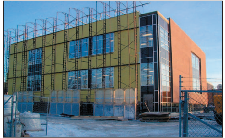
Students and staff began using the three-story ninth grade center (shown here) on Jan. 5. This mid-year move allowed construction to begin on the first floor below the media center. The media center will be on two levels after the renovations are completed.

The group focused on four issues: what should students know and be able to do when they graduate, how will the high school comply with state and federal regulations, how many credits are needed for graduation, and what schedule or method of delivery will fulfill all the requirements.