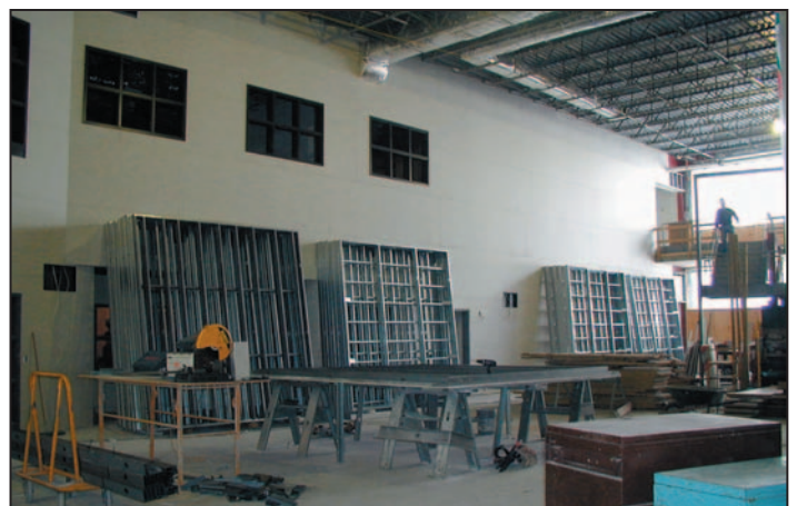
Work continues on the two-story media center at S.G. Reinertsen. Classrooms for fourth and fifth-graders will be on the second floor.