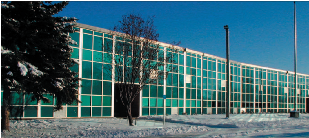
New blue curtainwall was installed on the exterior of Robert Asp School and Moorhead Junior High School (shown here) over the summer. The two schools are being renovated as K-5 elementary schools.

While construction continues on the schools, the Elementary Implementation Team has been meeting to develop the small learning communities within the schools. For more information see page 1.