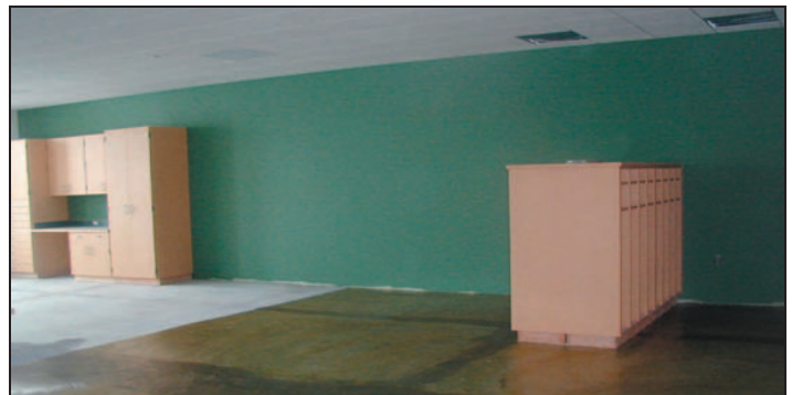
Kindergarten classrooms at S.G. Reinertsen have been painted. Ceilings and casework (cabinets) have been installed. Flooring is now being installed. The new school will open along with the other two elementary schools in the fall of 2004.