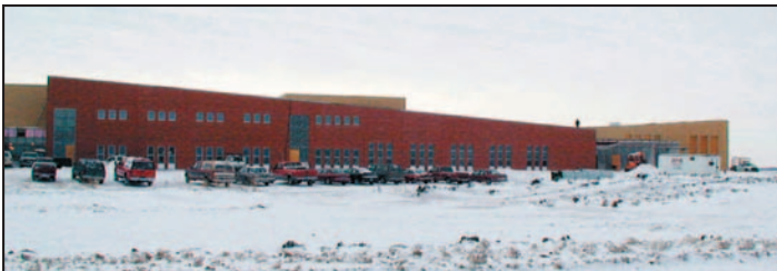
Construction on S.G. Reinertsen Elementary School in south Moorhead began in April 2003. The exterior of the school has now been bricked and many of the windows have been installed.

While construction continues on the schools, the Elementary Implementation Team has been meeting to develop the small learning communities within the schools. For more information see page 1.