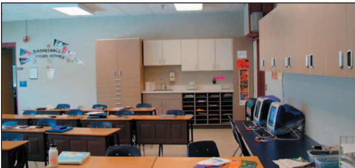
Classrooms in the two-story portion of Robert Asp School and Moorhead Junior High were renovated over the summer. Additional renovations will be done this summer.

Above: This classroom at Robert Asp has new cabinets and counters for classroom computers. Left: New ceiling mounted projection systems have been installed in remodeled classrooms at Robert Asp.