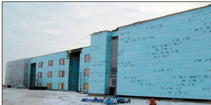
The three-story academic wing will have nine "houses" with about 130 to 150 students in each.

Further consideration will be given to additional opportunities for eighth-grade students and a recommendation for current seventh-grade world language students.