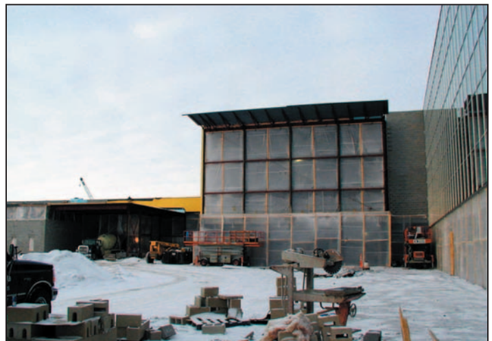
On the south side of Horizon Middle School, the exterior of the main entry and the media center take shape. Windows have been installed in the upper floors of the three-story academic wing.