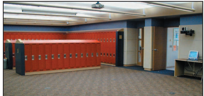
On each floor of the ninth grade center, classrooms surround resource areas, which have lockers and computers for students to use. Each floor will be a small learning community to help break down the size of the high school.