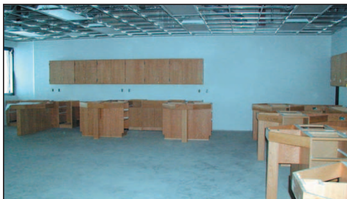
Classroom walls in the academic wing have been sheetrocked, and ceiling grid is being installed. Lab stations are being installed in the science classrooms.