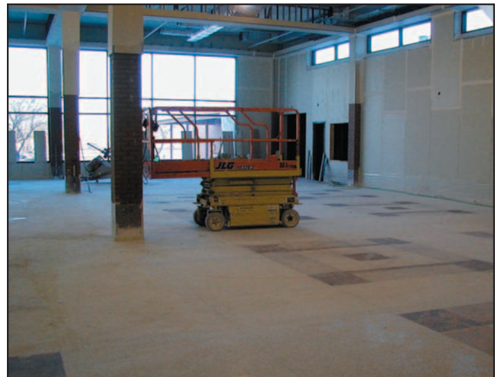
Next to the ninth grade center, construction continues on the new commons/cafeteria (shown here). On the east end of the school, the new fieldhouse is being built.

The design development phase for the conversion of Probstfield Elementary School to Probstfield Center for Education was approved by the School Board on Nov. 10, 2003. The district education center will house Early Childhood Family Education, Early Intervention Services, Head Start, Adult Basic Education, Community Education, and district offices.