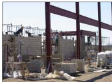
Interior corridors are being constructed from burnished block.