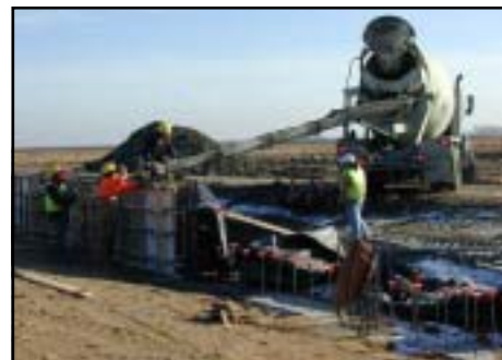
Concrete was poured in December for the foundation walls of the three-story academic wing.