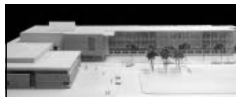
The model shows how the south-facing side of the new middle school's three-story academic wing will look.