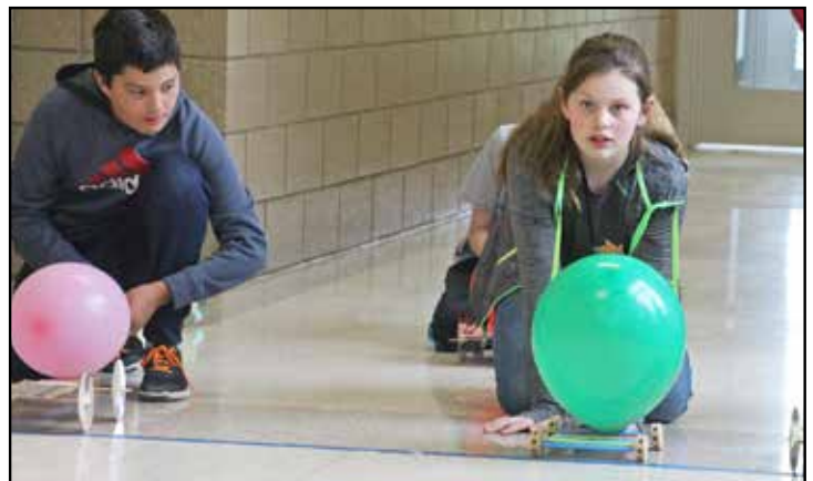
A Horizon Middle School student prepares to launch her balloon racer.

Student use of the 4Cs of communication, collaboration, critical thinking and creativity will increase from 1020 to 1030 based on the 2018 student BrightBytes survey.