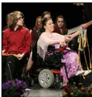
A Moorhead High School senior accepts her honor cords after being recognized as a salutatorian at the academic awards night.

Moorhead High School received a $1,000 donation from SpartanNash.