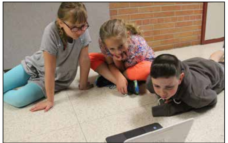
A small group of Ellen Hopkins Elementary School third-grade students review their video project.

Ellen Hopkins Elementary School students in K-4 will demonstrate an increase in behavior that communicates respect, responsibility and safety that will be reflected in a 20% reduction from 1,118 to 894 of total major incidents and reduce the daily incident rate from an average of 6.5 incidents per day to 5.2 incidents per day during the 2017-18 school year.