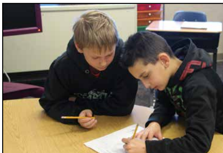
Robert Asp Elementary School students practice math skills with a math game.

All students will demonstrate an increase in behavior that communicates care, consideration, and respect of self that will be reflected in a 10 percent reduction of total major and minor incidents (a decrease from 651 incidents in 2016-17 to 587 incidents) and a reduction in the daily incident rate from an average of 3.36 per day (2016-17) to 2.75 per day in 2017-18.