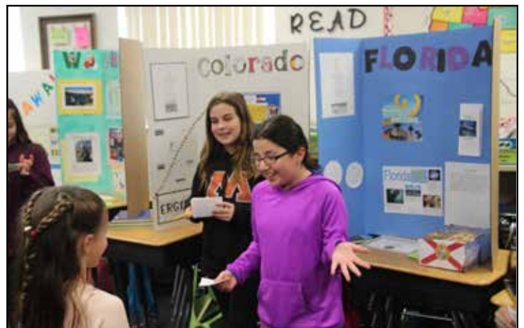
At the school's fourth-grade States Fair, S.G. Reinertsen Elementary School students share facts about their states with visiting students from other grade levels.

Office discipline referrals (ODR) in grades K-4 will decrease from 3 referrals per day to 1.5 referrals per day.