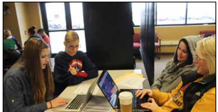
Red River Area Learning Center students and Minnesota State University Moorhead education students work on designing a logo as part of their business plan to address a food-related issue.

All Red River Area Learning Center students will develop 21st century skills related to communication, collaboration, creativity, and critical thinking, as evidenced by AVID learning walks conducted during advisor-advisee classes.